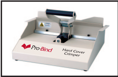
Pro-Bind Hard Cover Crimper