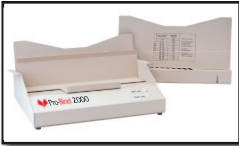
Pro-Bind 2000 & Cooling Stand