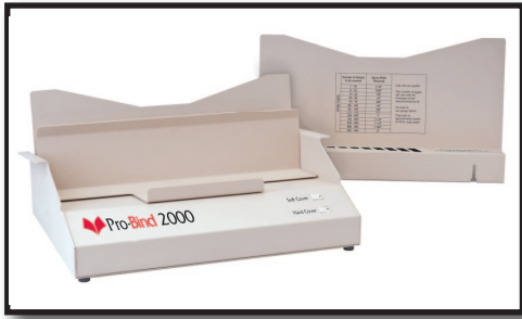
Pro-Bind 2000 & Cooling Stand